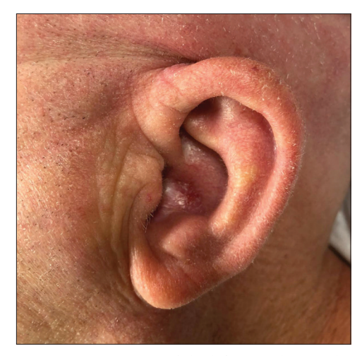
Figure 1: Carcinoma of the left auricular concha before surgery.