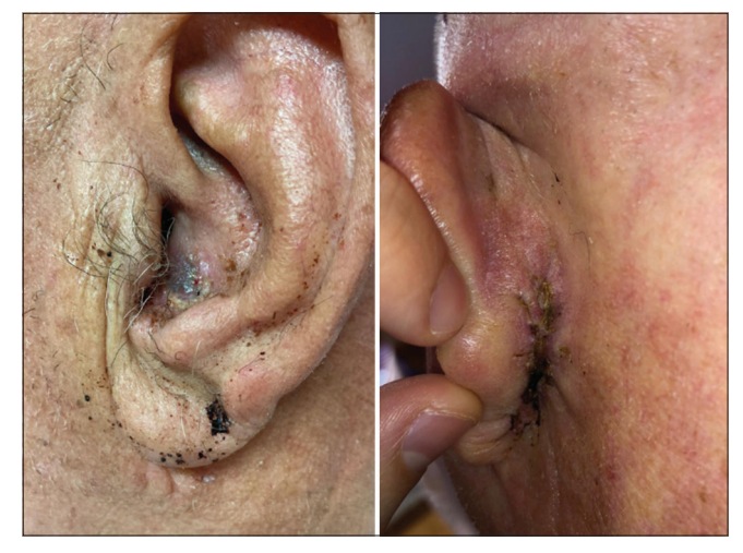
Figure 3: One month after surgery.

Due to the copious sensory innervation of the external ear, the Klein.<sup>4</sup> tumescence anesthesia method was preferred, so two infusions of 0.1% lidocaine mixed with epinephrine and sodium bicarbonate were administered, respectively, on the anterior and posterior faces of the auricle. At first, using an 11-blade scalpel, the concha auricular lesion was excised by incising the skin, the subcutis, and the cartilage. Next, at the retroauricular site, by incising in an anteroposterior and caudo-cranial direction the skin and the subcutis, a triangular flap size of about 4 cm long by 1.5 cm