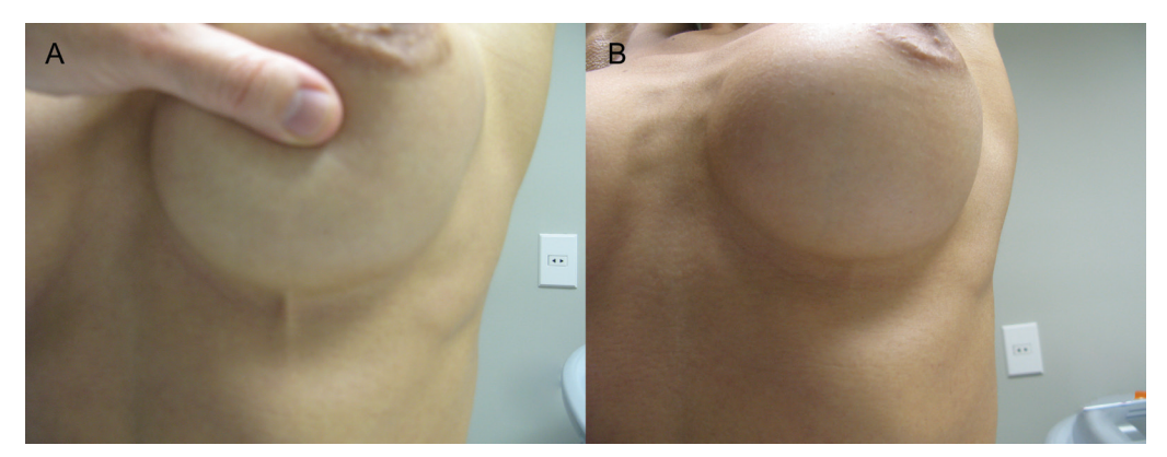
Figure 2: (A) Mondor's thrombophlebitis 2 years after augmentation mammoplasty. (B) The same patient 2 weeks after clinical treatment