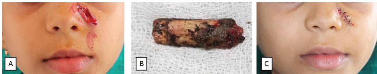
Figure 3: (A) Preoperative view. (B) Foreign body which turned out to be a wooden splinter. (C) Closure

removed under local anesthesia. The wound should be explored, foreign body should be removed, hemostasis should be achieved, followed by copious saline irrigation and suturing. It is advisable to prescribe antibiotic coverage as well as tetanus prophylaxis. [3]