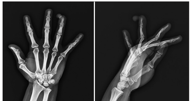
Figure 2: A plain X-ray (anterolateral and lateral views) of the left hand showed a well-defined soft tissue shadow around the tip of the ring finger without any connection with the distal phalanx