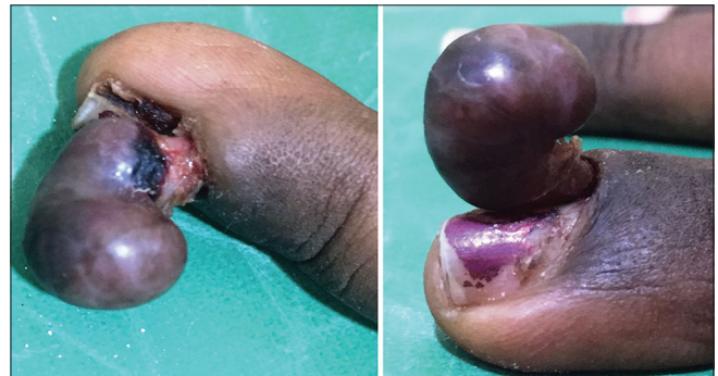
Figure 1: A 3 cm × 2 cm skin-coloured pedunculated growth arising from underneath the proximal nail fold of the left ring finger