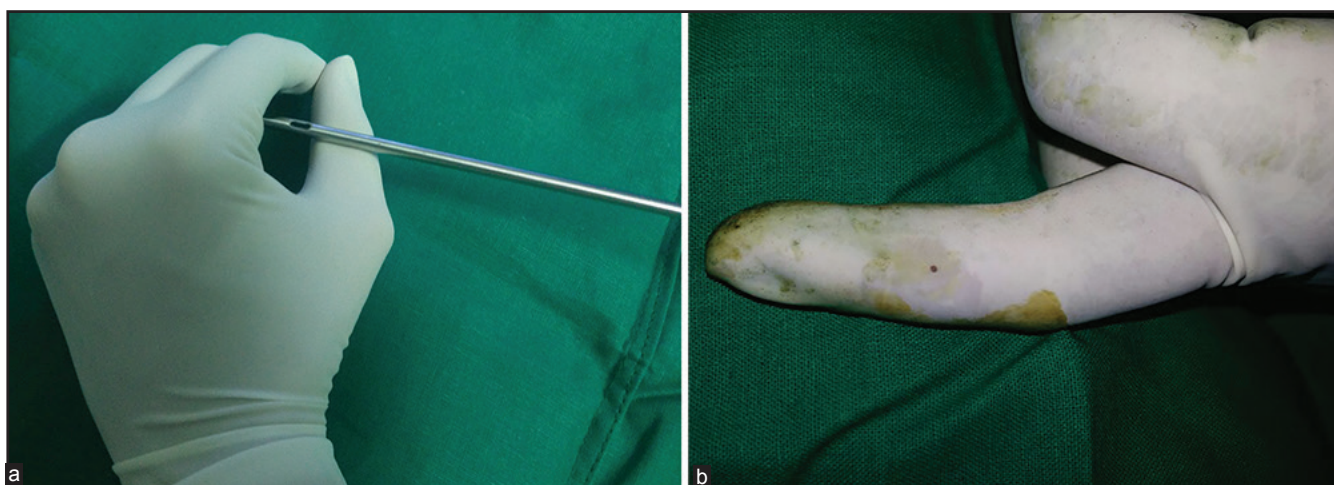
Figure 1: (a) The technique of guiding the cannula that may cause injury to the nondominant index finger (b) The glove puncture on index finger

In suction-assisted liposuction (SAL) blunt-tipped hollow cannula of various designs with variations in size and location of the holes are used [Figure 3]. Liposuction for gynecomastia is performed by placing the nondominant hand over the breast tissue to guide the cannula, while the cannula is held in the dominant hand and moved in a forward and backward motion.