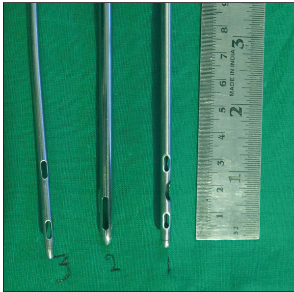
Figure 3: Various sizes and number of holes at the tip of liposuction cannula

As the liposuction proceeds close to the incision site, the holes in the cannula are likely to come in close proximity to the surface of the glove over the index finger of the supporting left hand and the negative suction pressure is likely to act on the surface of the glove causing accidental puncture in the glove. Another likely mechanism contributing to the glove puncture is the thermal injury caused by the friction developed between the gloved finger and the cannula during continuous to-and-fro movements. Both these mechanisms are likely to act independently or in combination to cause a glove perforation.