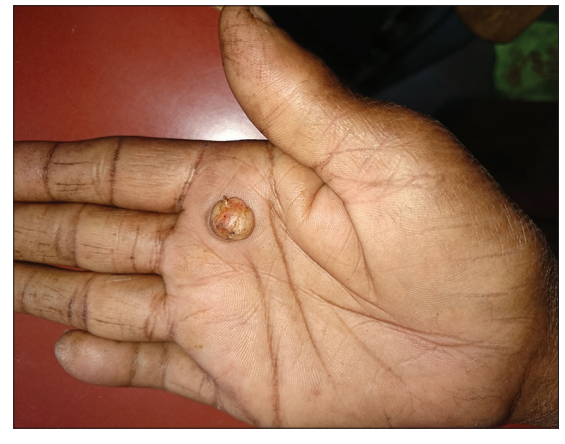
Figure 1: A 1 cm × 1 cm, dome shaped nodule near the base of index finger on right palm