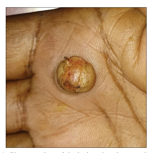
Figure 2: Close-up view of the lesion showing a nodule with a peripheral collarette of raised skin

Access this article online Quick Response Code: Website: www.jcasonline.com