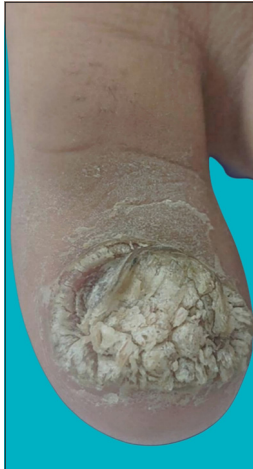
Figure 1: Verrucous lesion on the big toe.