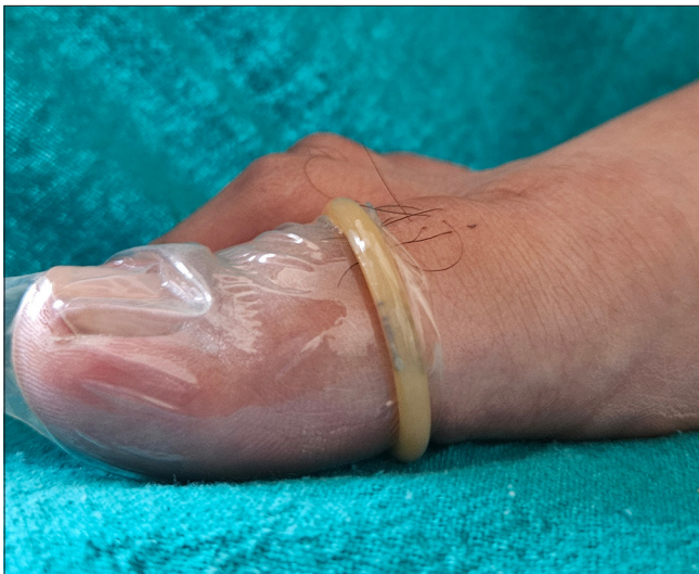
Figure 2: Condom worn over the big toe.

beneficial in promoting the resolution of warts [Figure 3]. This simple, easily available, and cost-effective technique may be a milestone in the treatment of periungual warts. The said case [Figures 1-3] was treated in 6 weeks of topical application under occlusion with a condom.