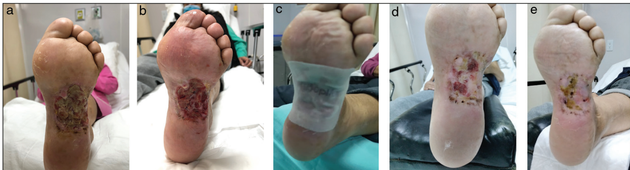
Figure 1: Diabetic ulcer in left plantar area with 4 months of evolution. (A) Chronic wound in the first clinical assessment. (B) At the end of the “TIME” protocol. (C) Pre-fabricated biological allograft applied. (D) Chronic wound at the end of the first application. (E) Chronic wound at the end of the second application

The most frequent location of chronic wounds was the lower extremity in 58.6% ( n = 78 ). Other anatomical areas affected were the sacrum and upper extremity in 15.7% ( n = 21 ) and 9.7% ( n = 13 ), respectively. The least affected anatomical regions were the head, thorax, breast, and abdomen [Figure 2]. The 72.9% ( n = 97 ) of all the chronic