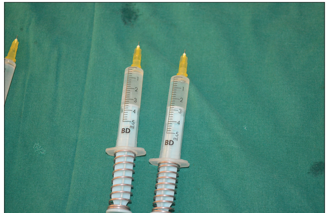
Figure 2: Spring-loaded 5 cc syringes

With this syringe, small quantities of material can be injected by first piercing the needle into the tissue, pressing the piston using the thumb and removing the thumb which results in the recoil of the piston; the syringe is withdrawn from the skin, following which the next site is injected [Video 1]. Before disposal of the syringe, the spring can be removed and retained for reuse after sterilisation. The approximate cost of the spring-loaded syringe would be 30