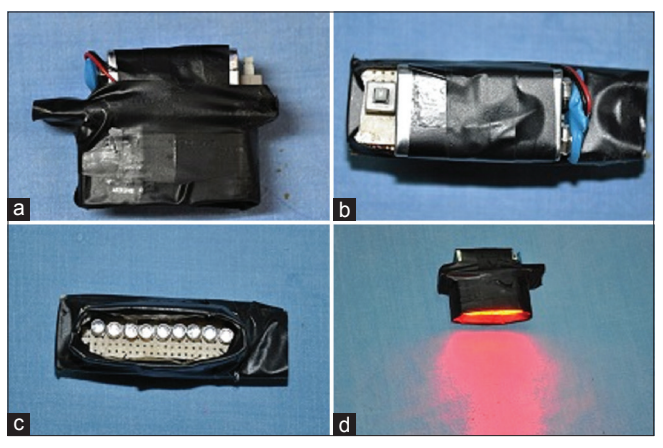
Figure 1: (a) Finger-shaped red light emitting diode device; side view: battery on top, (b) top view: 9V battery power source with a switch adjacent, (c) bottom view: row of nine light emitting diodes on a plastic board, (d) opaque black cover allows light to pass only through bottom

Therapies for periungual wart are targeted only to that portion visible to the naked eye. Subungual extension of wart can be missed with the naked eye examination. For subungual extension, most