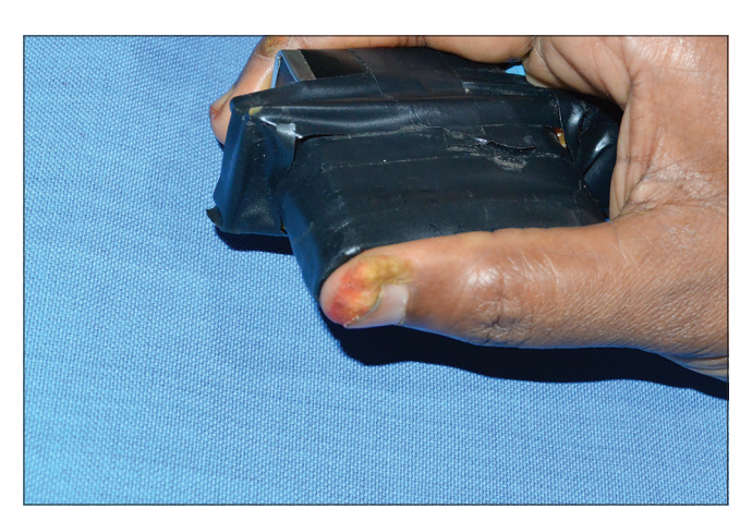
Figure 3: Light emitting diode device fits snugly when placed with its bottom on the finger

treatment modalities require a partial nail avulsion before targeting therapy except for those having immunomodulatory action like bleomycin. This device addresses this problem of assessment and delineates the complete extent of the periungual wart with distinct advantages [Table 2].