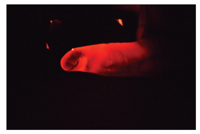
Figure 4: Periungual wart stands out black against a bright red background