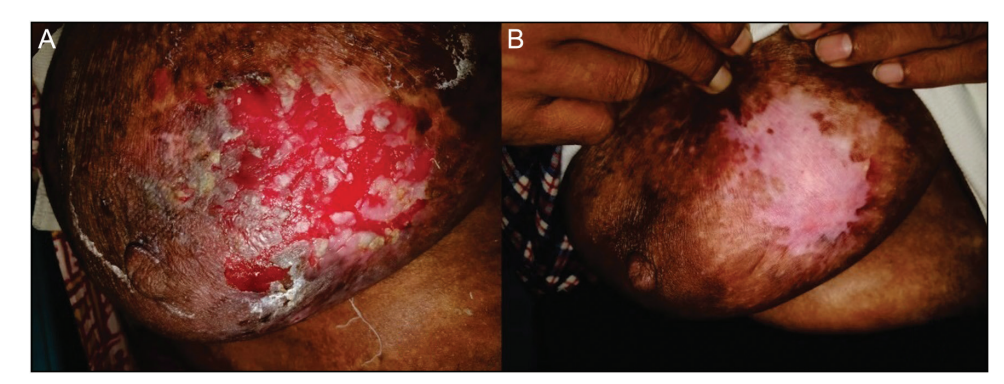
Figure 2: Ulcer of pemphigus vulgaris. (A) At week 0. (B) At week 6