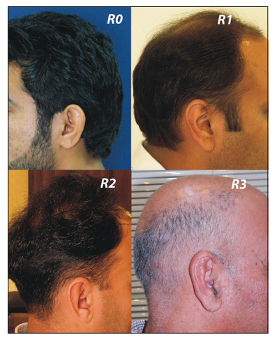
Figure 3: Reverse thinning (R)