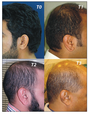
Figure 4: Overall thinning (T)

by Lee et al. in Asian population in 2007.<sup>[10]</sup> The BASP classification has various points which are difficult to memorise. In spite of the claim, it is more complicated and has limitations too. It has not been able to get a