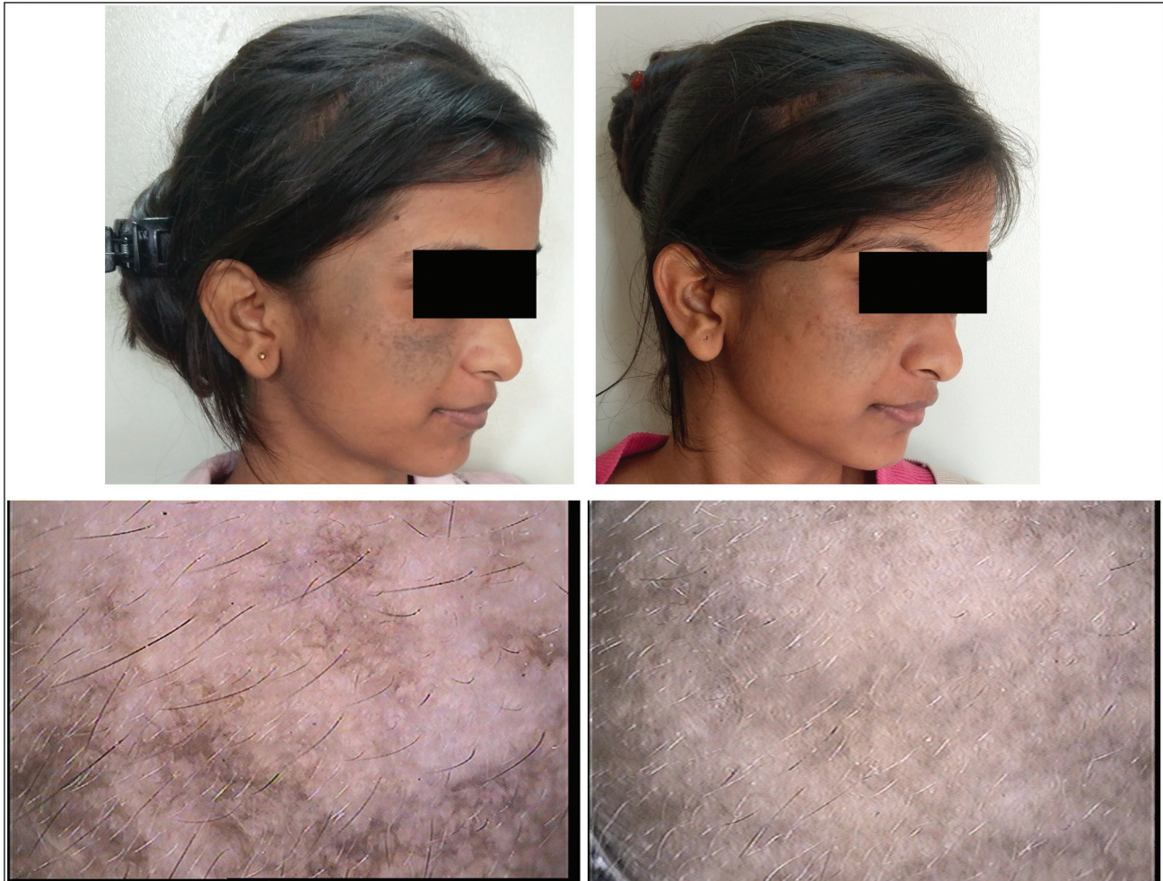
Figure 4: Pretreatment (A) and posttreatment (B) photographs of group 1 patient showing PGA grade 1 improvement. Pre-dermoscopy (C) and post-dermoscopy (D) images of same patient showing grade 1 improvement on dermoscopy after six sessions

classically distributed unilaterally on areas supplied by the ophthalmic and maxillary divisions of trigeminal nerve. Ocular pigmentation of sclera, cornea, iris, and retina can occur. Hard palate is rarely involved. The pigmentation increases in size and color till puberty.