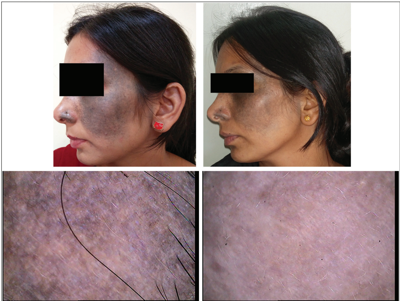
Figure 3: Pretreatment (A) and posttreatment (B) photographs of group 2 patient showing PGA grade 3 (>50%) improvement. Pre-dermoscopy (C) and post-dermoscopy (D) images of same patient showing grade 3 improvement on dermoscopy after six sessions

After three sessions, majority of patients (approximately 57%) reported score of 6 on WBFPS scale. Approximately one-third patients in group 1 reported scores of 8 and 10, whereas no patient in group 2 had similar scores. This comparison between two groups was found to be statistically significant ( P < 0.0001 ). After six sessions, approximately 72% patients in group 2 versus 11% patients in group 1 reported WBFPS 2. Higher number of patients in was satisfied with combination treatment than single laser treatment on WBFPS score ( P < 0.0001 )