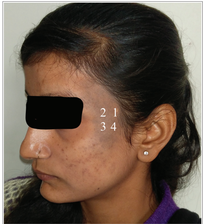
Figure 1: Points taken to perform dermoscopy. First point around biopsy side, second point is 2 cm medial (or lateral) to biopsy site, third point is 2 cm below the second point, fourth is 2 cm below first point

Broad-spectrum sunscreen was given to all patients and was continued throughout the study.