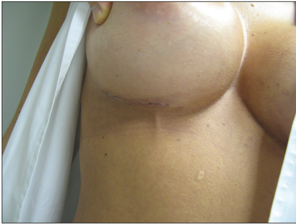
Figure 3: Mondor's disease presenting as a fibrous cord below the right breast 3 weeks after silicone breast implant

augmentation. [13] We observed a delay of several weeks between surgery and the onset of symptoms. Sometimes the delay between surgery and Mondor's disease can be as long as 13 years. [22] On the other hand, there is neither a close relationship between Mondor's disease and silicone breast implants nor between Mondor's disease and capsule contracture. [23]