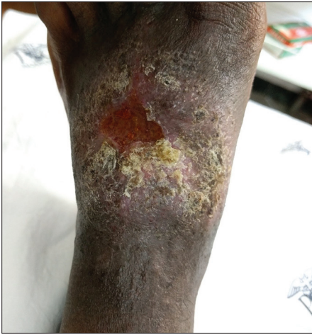
Figure 3: Patient 1 before treatment with platelet-rich fibrin dressing