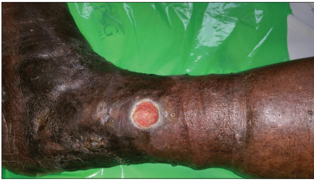
Figure 9: Patient 4 before treatment with saline dressing