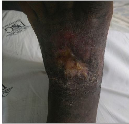
Figure 4: Patient 1 after 4 weeks of treatment with platelet-rich fibrin dressing