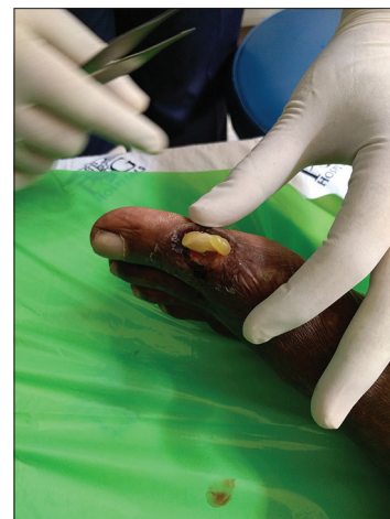
Figure 2: Platelet-rich fibrin placed on the ulcer

PRF is an autologous platelet and leucocyte-rich fibrin material and is an important advancement in regenerative medicine. It