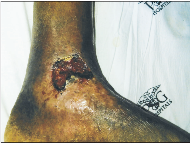
Figure 5: Patient 2 before treatment with platelet-rich fibrin dressing