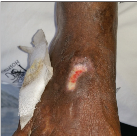
Figure 7: Patient 3 before treatment with saline dressing