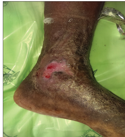
Figure 6: Patient 2 after 4 weeks of treatment with platelet-rich fibrin dressing