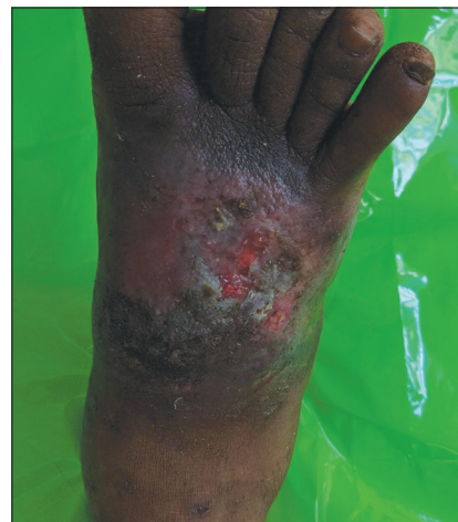
Figure 8: Patient 3 after 4 weeks of treatment with saline dressing

of 85.51% in ulcer area at the end of 4 weeks in patients treated with PRF which is faster when compared to saline group.