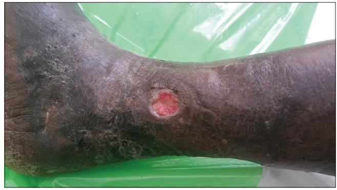
Figure 10: Patient 4 after 4 weeks of treatment with Saline dressing