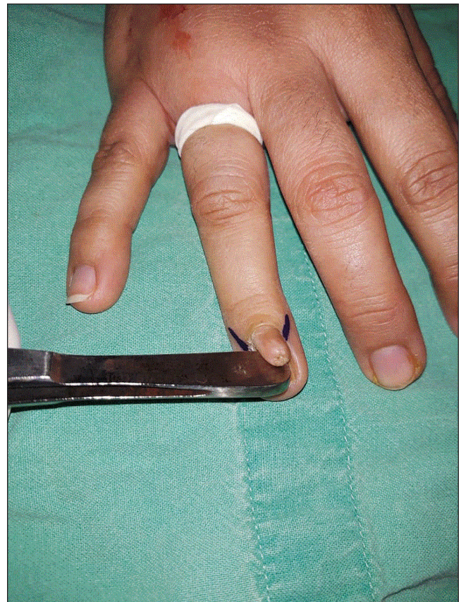
Figure 1: Fingerlike growth (12 mm) of right ring finger and tourniquet application and marking for epinychia flap raising

and has subcutaneous fat [Figure 2]. The patient nail and epinychia fold appeared normal after 9 months [Figure 3], and now she has no problem in wearing the ornament (ring) and she attends social gatherings without any embarrassment.