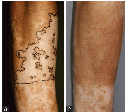
Figure 2: (a) A patient with segmental vitiligo on the right arm; (b) Repigmentation after non-cultured cellular grafting

A review of the available literature was performed to assess the effectiveness and developments in the technical procedure of non-cultured cellular grafting.