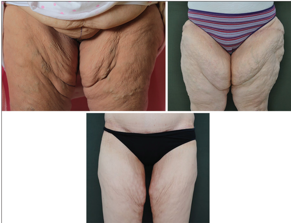
Figure 1: Typical skin-fat excess in the medial thigh