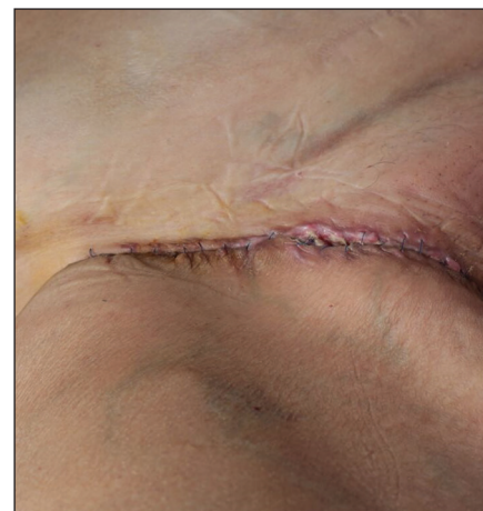
Figure 2: Wound dehiscence

Unfortunately, this type of surgery can lead to a high percentage of postoperative complications [Figure 2]. The most frequent complications are scar migration, wound dehiscence, scar infection, hematoma, lymphedema, and gaping vulva. [5-7] Over the years, new surgical techniques have been proposed to minimize these complications.