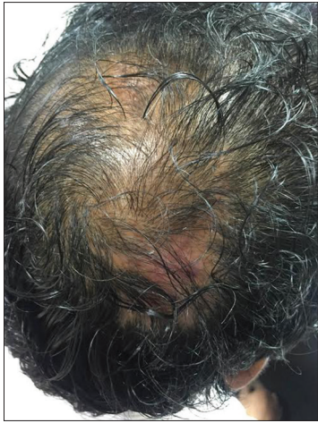
Figure 5: Follow-up, 6 months

and Bozi. [4] The first, a plaque type, presents upon the scalp as a hairless lesion, which can be present from birth, and thereafter increases during the onset of puberty into nodular or verrucous entity. This type is most often closely, but not mandatorily, associated with a sebaceous nevus of Jadassohn. The second, a linear type, usually presents with multiple papules of similar size, with an umbilicated appearance, often being confused with a diagnosis of molluscum contagiosum. The last, a solitary nodule, usually presents on the trunk, perhaps on the genitalia, shoulders or axillae.