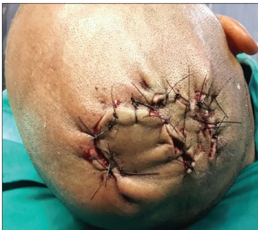
Figure 3: Post-surgery and reconstruction