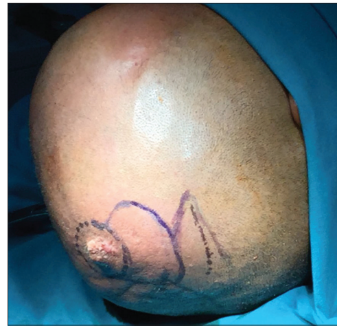
Figure 2: Marking for wide local excision and bilobed flap reconstruction