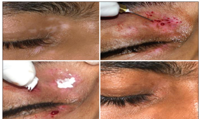
Figure 2: Therapeutic wounding.

the possible complications. In a case study, Hirobe and Enami showed the use of an electric micro-drill to create a graft that was 1.5–1.8 mm deep and had a diameter of 0.6–1.0 mm. This reduced the chance of cobblestoning and enhanced pigment distribution. 27 According to a clinical trial conducted by Ragab et al. , the greatest degree of repigmentation and fastest response were obtained with mini-punch grafting and weekly needling over 6 months. Only transverse needling and mini-punch grafts outperformed the control group in terms of outcomes. There were no documented negative effects related to steroids. Consequently, the application of transverse needling after mini-punch grafting positively impacts the ultimate therapeutic outcomes. Compared to MPG and needling done separately, this adjustment enables