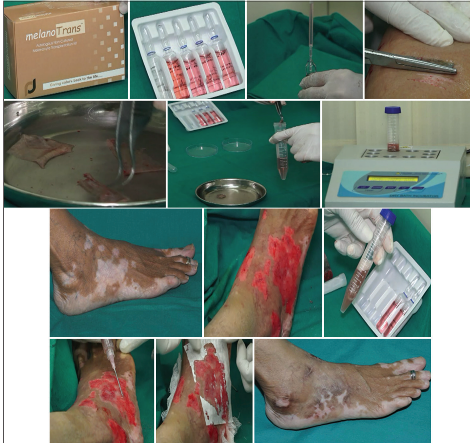
Figure 8: Preparation of Autologous non-cultured melanocytes-keratinocytes cell suspension.