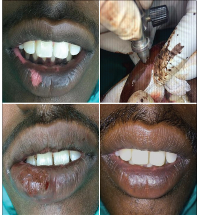
Figure 1: Tattooing in lip vitiligo.

Over time, changes have been made to procedures such as the way tissue for transplants is obtained, which has reduced