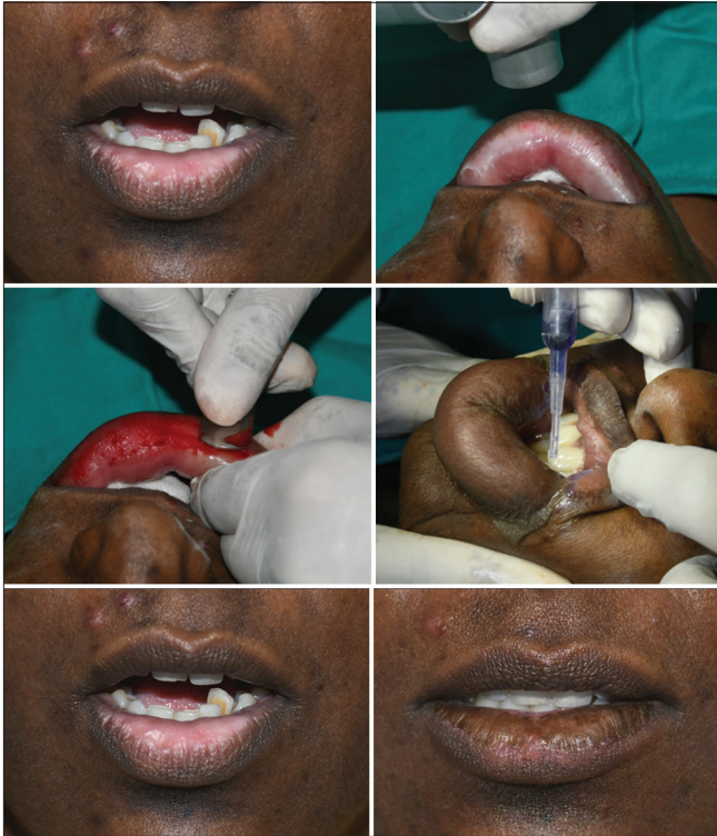
Figure 6: Suction blister grafting for lip vitiligo.

[Figure 8]. Vitiliginous areas of any size, shape, and at any place can be treated except fingertips, toe tips, palms, and soles. 3,15-18,22,24,37