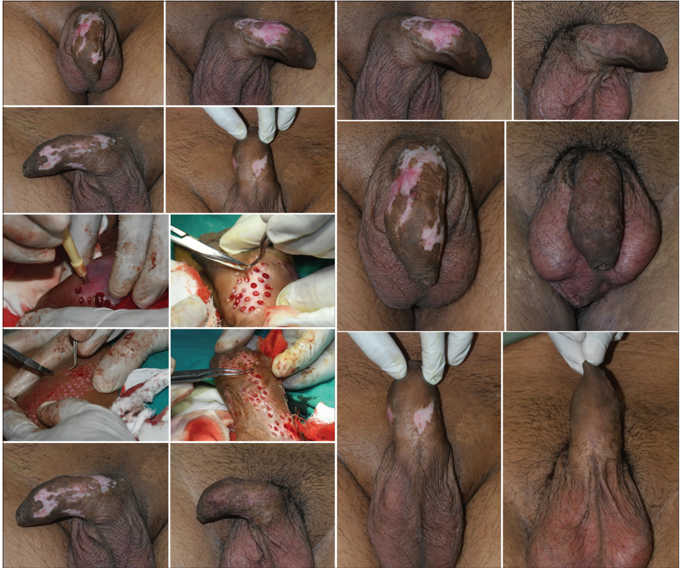
Figure 5: Miniature punch grafting for genital vitiligo.