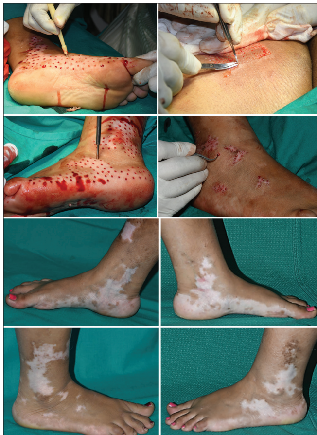
Figure 4: Miniature punch grafting for acral vitiligo.

one to achieve a higher degree of repigmentation in less time and with the lowest cumulative dose of NB-UVB. 28