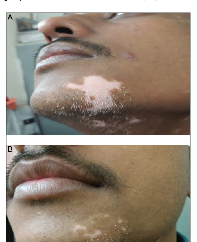
Figure 1: (A) Vitiligo patch before FUT. (B) Vitiligo patch after FUT at 20 weeks

While considering time taken for repigmentation, we found that 25%–50% and 50%–75% repigmentation was observed in 27 of 50 (54%) and 8 of 50 (16%) lesions in JT group and in 22 of 50 (44%) and 2 of 50 (4%) lesions in