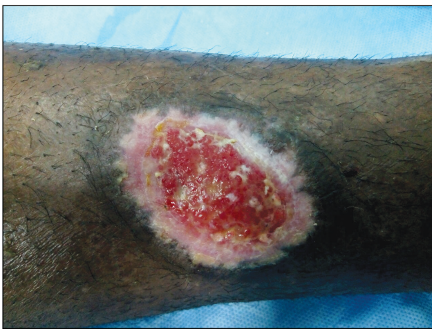
Figure 10: A diabetic ulcer healing with few yellowish pin-head-sized dome-shaped colonies of cells

completely [Figure 10]. Hypertrophic granulation tissue was seen in two of the ulcers, which subsided spontaneously within a week with regular normal