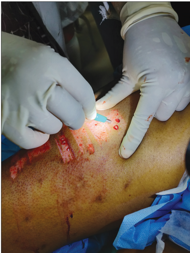
Figure 5: Follicular dermal grafts harvested using a 3.5-mm punch from the donor area