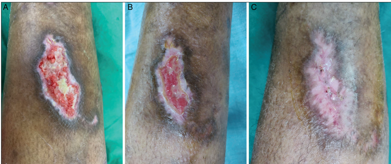
Figure 9: Another healing ulcer: (A) at baseline, (B) on day 7 post-procedure, and (C) at week 4 post-procedure