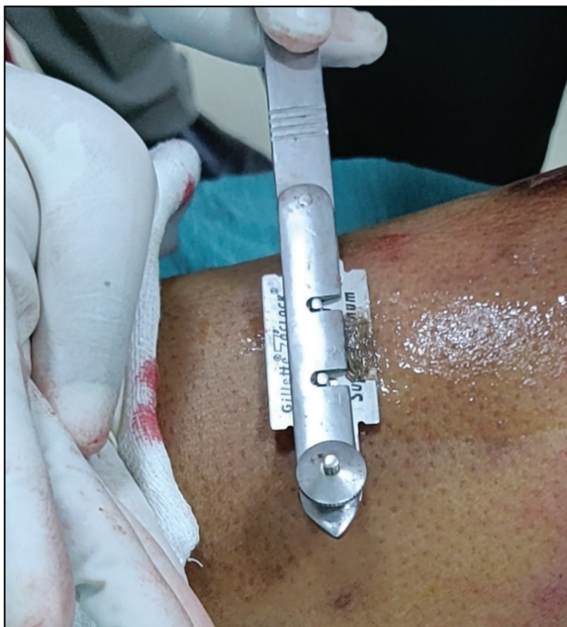
Figure 1: Ultra-split thickness epidermal graft harvested from donor area using graft-harvesting dermatome