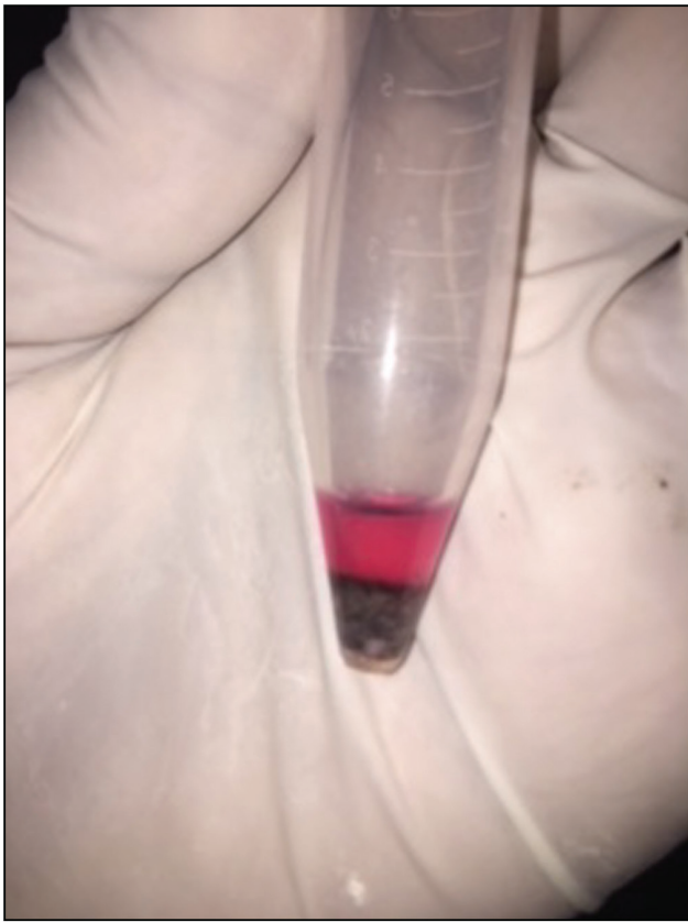
Figure 4: Cellular sediment after centrifugation at 3000 rpm for 10 min