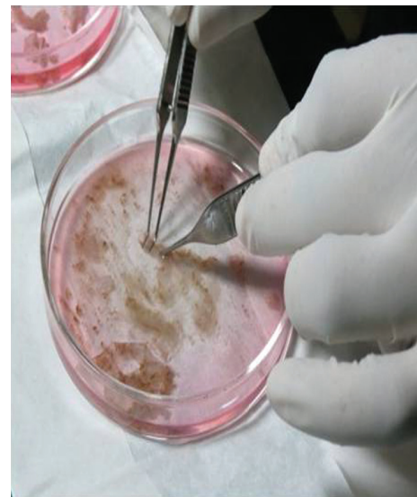
Figure 3: Separation of epidermal component from dermis by gentle agitation in DMEM