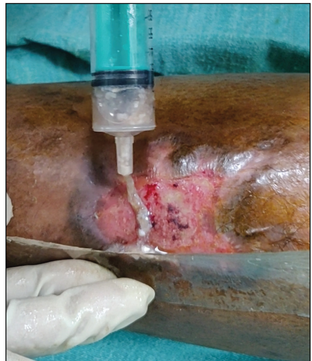
Figure 7: Application of the suspension evenly over the ulcer bed