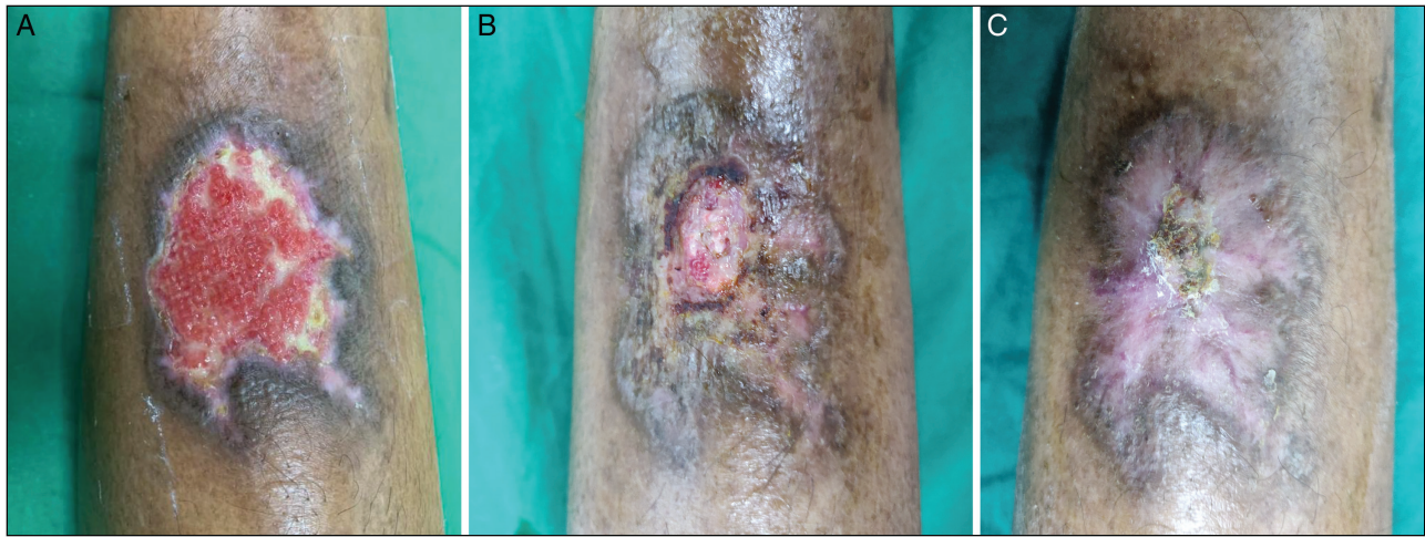
Figure 8: A healing traumatic ulcer: (A) at baseline, (B) on day 7 post-procedure, and (C) at week 4 post-procedure