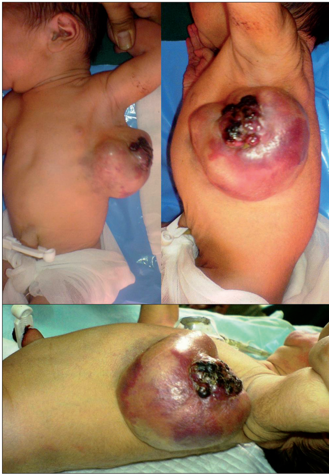
Figure 1: Different views of a large lobulated (about 10 × 10 cm) mass located in the left lateral chest wall region (lateral to the left areola and just below the axila), in a full-term male newborn

all congenital lesions and 3% of childhood tumours. [7-9] In children, under the age of 15, CFS is responsible for 40% of STS. Its prevalence in children aged under 5 and of perinatal period is >50% and >33%, respectively. [8] Thus, actually, it is the most common STS among children under 1 year of age. [10] CFS is a tumour with a limited biological activity. The phenotype, survival rate and recurrence rate of CFS are not fully known due to small number of truly congenital cases on record and thus very few published series. [11] During last 40 years, there have been only two major published series. Chung and Enzinger [4] recorded 53 cases with 20 congenital tumours. Soule and Pritchard [5] performed a review of 110 cases with 36% incidence of CFS. The most frequent tumours of the chest wall are the malignant small round cell tumours (Ewing's sarcoma/primitive neuroectodermal tumour [PNET] family) followed by rhabdomyosarcoma, osteosarcoma, chondrosarcoma and a spectrum of other sarcomas. [12] Over last 40 years, only about 60 cases of CFS have been documented to be congenital. [2,3] The chest wall tumours are rare occurrences in infants, [12] and the chest wall as the site of origin for CFS has been very rarely mentioned. [1]