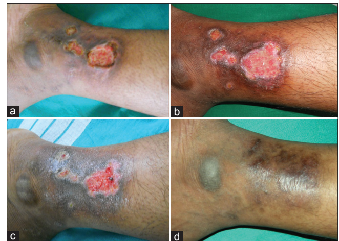
Figure 1: (a) a patient of venous ulcer of duration 3 months, (b) after one sitting of platelet rich plasma, (c) ulcer at 4 th week and (d) ulcer being healed at 6 th week