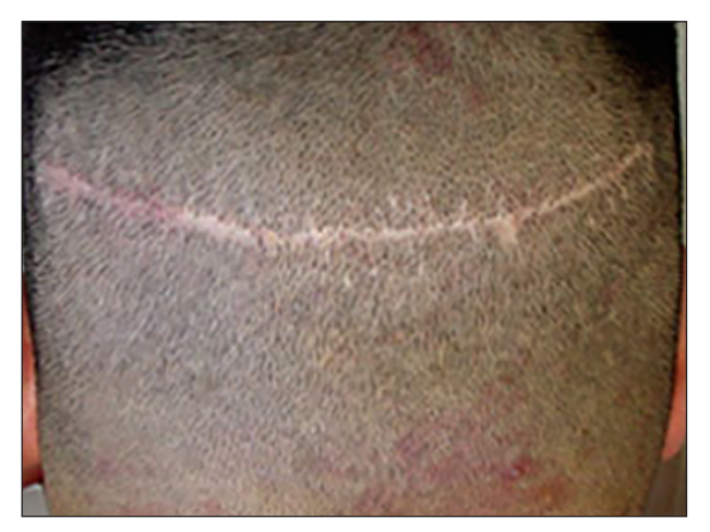
Figure 1: A single linear scar from donor strip harvesting