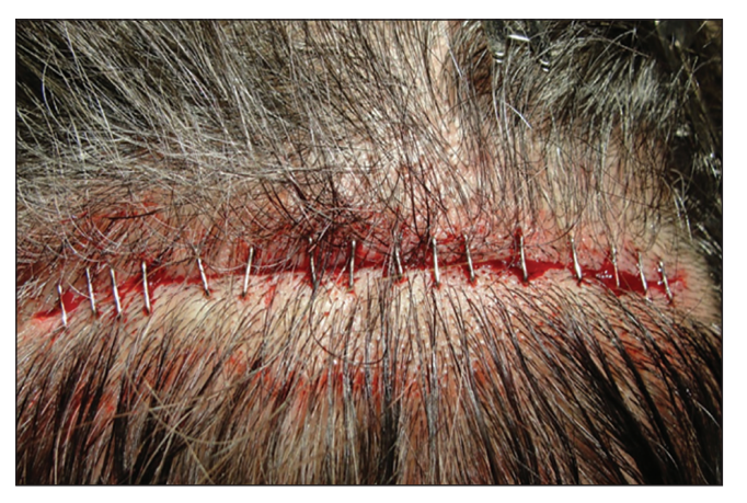
Figure 2: Staples or sutures are used to close the donor area following the strip method

Furthermore, irrespective of whether FUE is performed by manual, motorized or robotic punches, there is the risk of a clinically apparent depletion of hair from the donor region as with donor elliptical harvesting. This may create an iatrogenic "motheaten" or "pseudo-syphilitic" appearance. In addition, proper spacing and removal of harvested follicular groupings is vital to reduce the risk of necrosis and cyst formation. [7,8] No one knows how many follicular groupings can be safely harvested from the donor region with FUE. The incisions with FUE are more widespread than those with