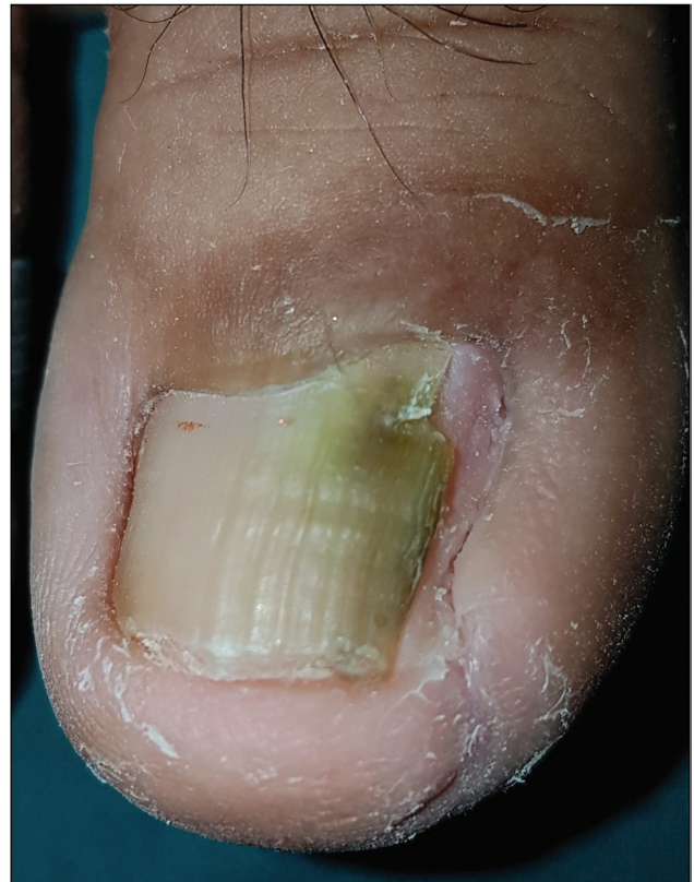
Figure 2: Completely healed wound at 4 weeks post surgery

Surgical treatment is the mainstay of treatment of harpoon nail. It consists of deroofing the canal followed by avulsing the lateral strip of nail plate and chemical destruction of the exposed matrix, as carried out in our