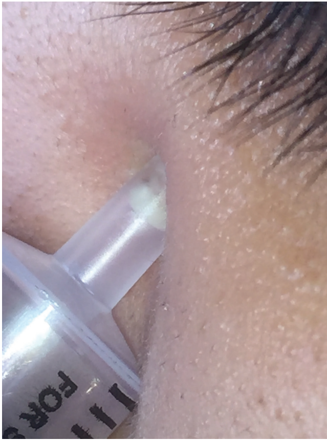
Figure 2: The comedone is pressed and dragged with the modified syringe needle hub

and dragged [Figure 2 and Video 1]. There is no incidence of prick or puncture injury and post-inflammatory hyperpigmentation. During the procedure, bleeding is less and if it is there, it should be hemostasised as soon as possible to avoid post-procedure hyperpigmentation.