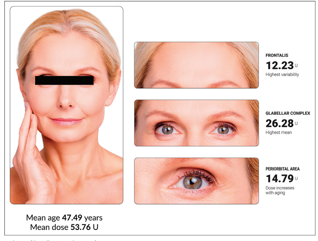
Figure 3: Total mean dose of botulinum toxin type A per area