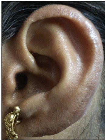
Figure 3: Good contour and no recurrence at 12 months

anatomic landmarks, no sacrifice of important structures and a debulking effect. [8] Lee described keloid core excision developing a keloid rind flap which is nourished by a subcapsular vascular plexus. [10] Kim in 2005 published his experience with the fillet flap and stressed on the 5 As and 1 B i.e. a sepsis, a traumatic technique, absence of raw surface, avoidance of tension, accurate approximation of wound margin and haemostatic control. [11]