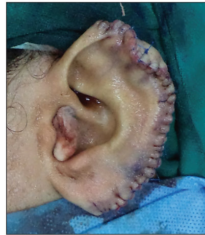
Figure 2: Keloid core excision with helical contour restored with fillet flap