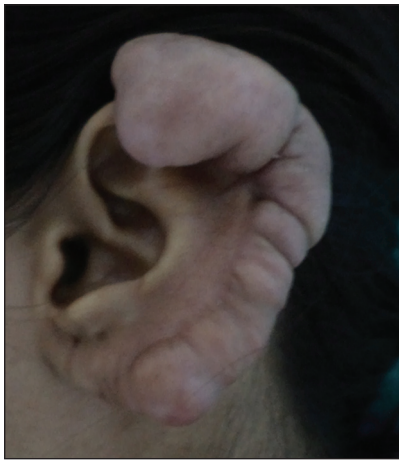
Figure 1: Preoperative view of post flame burns keloid involving helix and earlobe