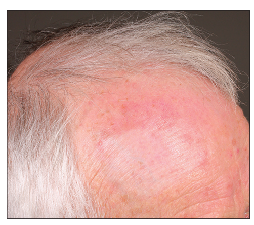
Figure 5: Patient post treatment with combination KA10/5FU therapy

incorporated into DNA and RNA, inducing cell cycle arrest and apoptosis. It is possible that 5FU had an apoptic effect on the inflammatory cells making up the infiltrate. 5FU is a simple and safe injection material and should be considered by clinicians as an option for treatment of GF. The response rate in patients with GF is not rapid (although similar to the rate seen with use in keloid scarring), and many injections are necessary to achieve success. The utility is in its' ability to induce long periods of remission in the form of a disease-free interval, without the atrophy and rebound effects that are present with intralesional corticosteroids and other therapies.