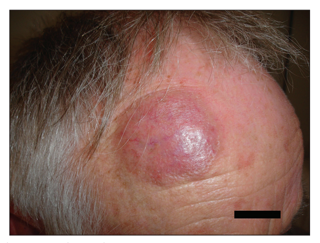
Figure 1: Patient prior to treatment

The mild response of the lesion to intralesional steroids led to the idea of using intralesional 5-fluorouracil (5FU) as a steroid-sparing or replacement agent, in a similar way to the use of 5FU in hypertrophic and keloid scarring. [5,6] 5FU acts in a similar way to a steroid agent in keloid and hypertrophic scars, without the unwanted atrophic effects. [7] As first described by Fitzpatrick in the treatment of scars in 1999, an 80:20 mix of 80% 5FU (DBL Fluorouracil, 500 mg/10 ml, Hospira Australia Pty Ltd, Melbourne, Australia) and 20% KA10 was used to initiate treatment. [8] This yielded a mixture in a 1 ml syringe of 0.8 ml 5FU and 0.2 ml KA10. When initially reported, the small amount of steroid was added to the 5FU to limit the pain of injection. [8] The patient received intralesional KA10 and 5FU combination injections