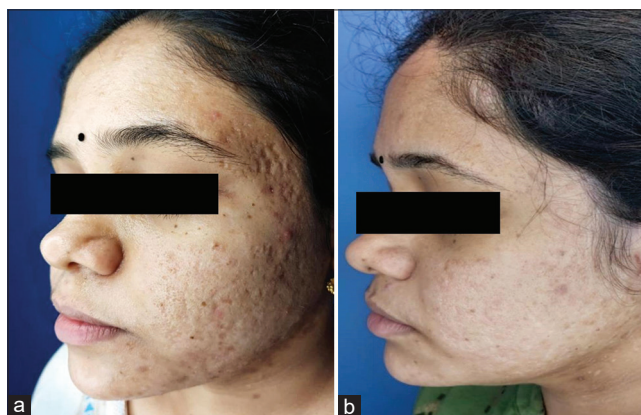
Figure 2: Improvement in the acne scars from (a) grade 4 to (b) grade 2 during follow-up (1 month after the last session).