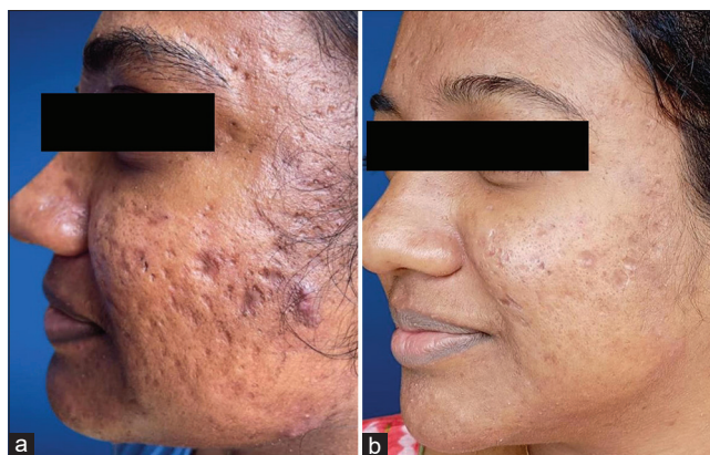
Figure 3: Improvement in the acne scars from (a) grade 4 to (b) grade 3 during follow-up (1 month after the last session).

tendencies, mainly in adolescents and young adults. Scarring is more typically seen in inflammatory acne than non-inflammatory acne. Inadequate response in healing results in diminished deposition of collagen, which leads to the formation of an atrophic scar, and if the healing response