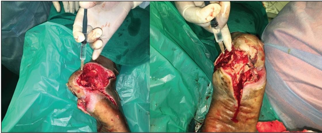
Figure 2: Wound after debridement and injection phenytoin being sprayed over the wound