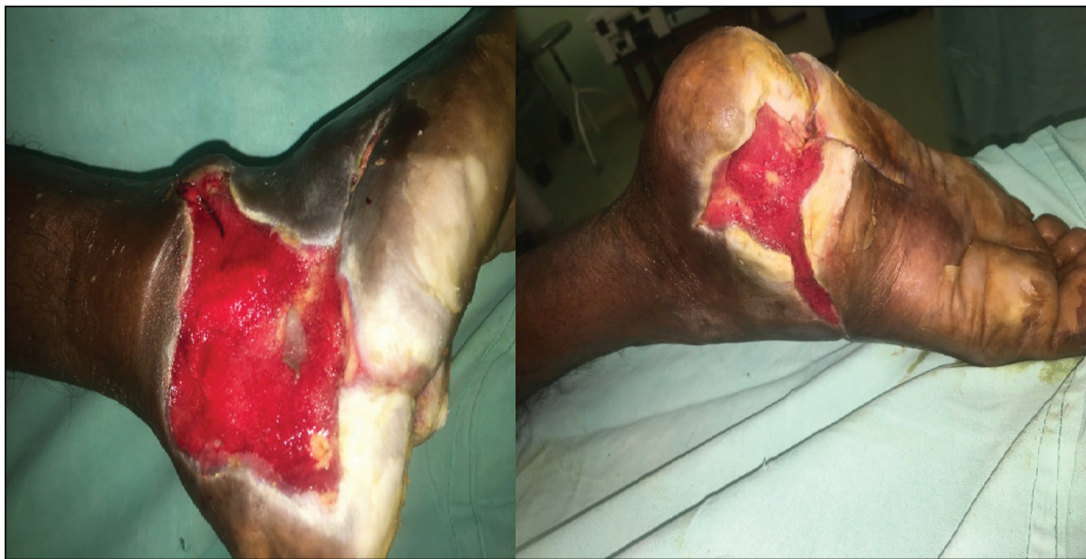
Figure 3: Wound after five applications of topical phenytoin

All the studies that are mentioned stated that phenytoin causes increased fibroblast proliferation, enhances granulation tissue formation, and decreases bacterial contamination. However, Shaw et al. [17] stated that there were no differences in diabetic foot ulcer closure rates or in diabetic foot ulcer area over time between the two groups when phenytoin is used.