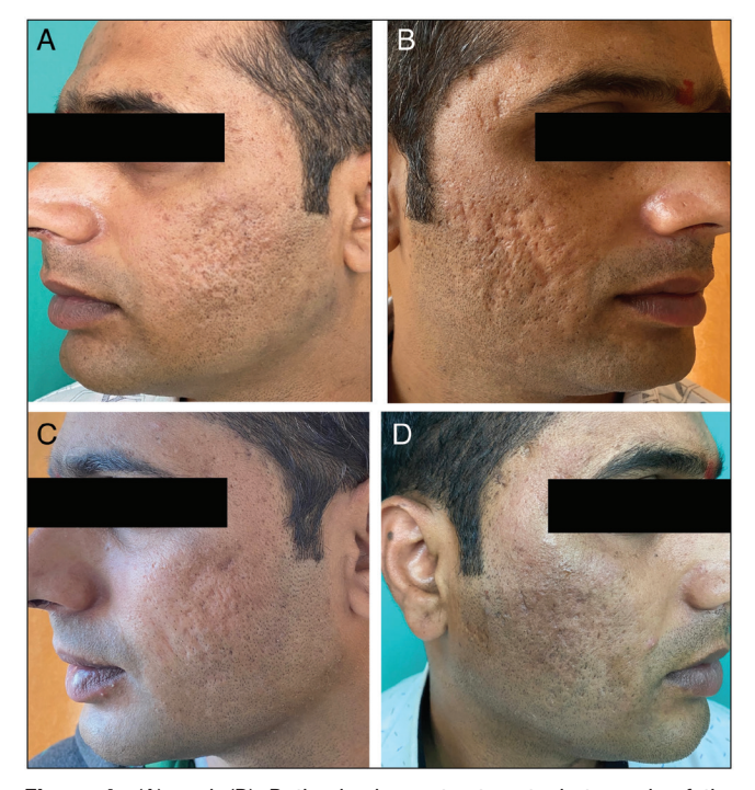
Figure 4: (A) and (B) Both cheeks pretreatment photograph of the patient showing acne scars of GBS grade 4, GBS scale 26, PGA-grade 4, and VAS-0. (C) Mild postinflammatory hyperpigmentation on the right cheek. (D) At the sixth visit, GBS grade 2, scale reduced to 7, PGA-grade 2, and VAS-3 (extremely satisfied)

of platelets and their growth factors in the PRP is much higher than in PPP, fibrinogen concentration in PPP is much higher compared with PRP. The fibrin fibers are usually formed in bundles in PPP unlike in PRP. The direct volumetric filling effect of the gel is due to the denaturized gelled proteins and fibrin bundles, providing constant stability and volume.<sup>[3]</sup> This fibrous network of insoluble fibrin provides a scaffold for platelets that serve as a source for the sustained release of growth factors.<sup>[18]</sup> This scaffolding helps localize the growth factors and increase