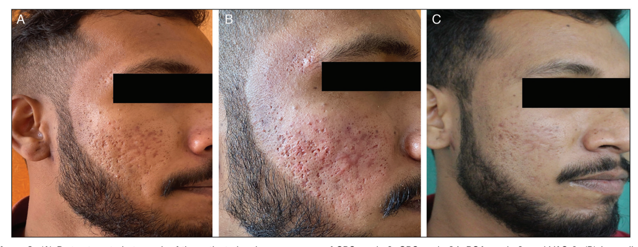
Figure 3: (A) Pretreatment photograph of the patient showing acne scars of GBS grade 3, GBS scale 24, PGA-grade 3, and VAS-0. (B) Immediate volumetric effect and transient erythema. (C) At the seventh visit, GBS grade 2, scale reduced to 10, PGA-grade 2, and VAS-3 (extremely satisfied)