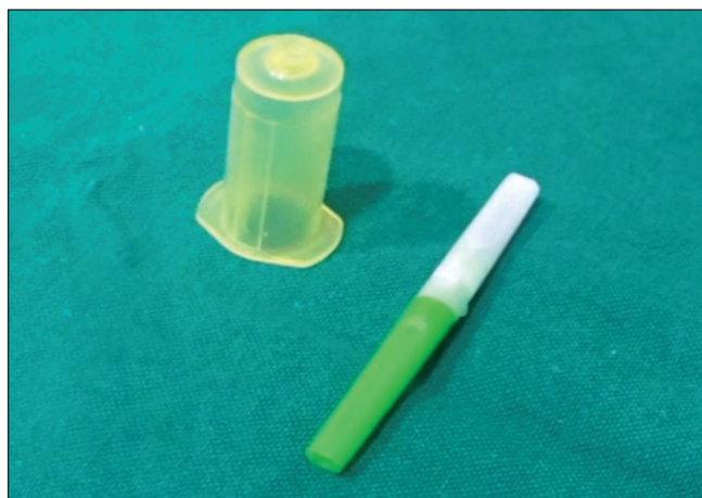
Figure 2: Venipuncture using BD Eclipse™ blood collection needle