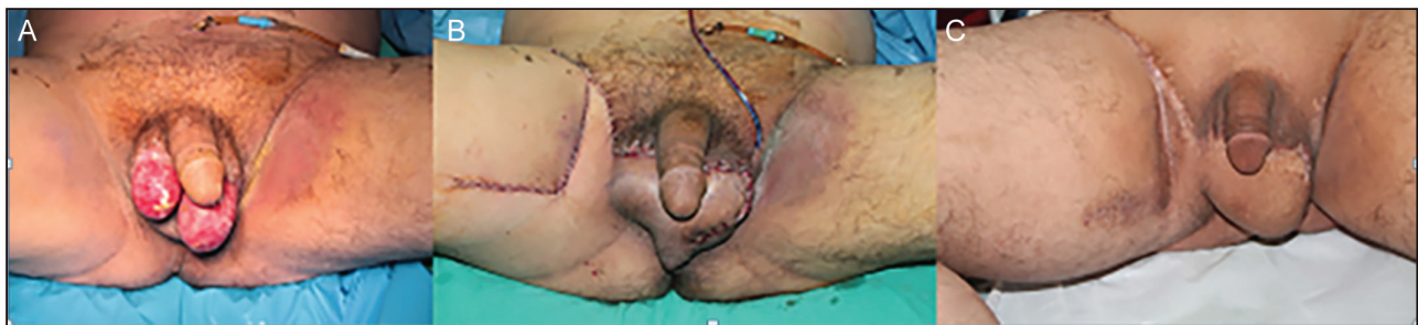
Figure 1: Bilobed pudendal flap and vascular support (A) Scrotal debridement and testicular wound care were performed to prepare the participants for reconstruction following Fornier's gangrene. (B) Open testicular wound was fully covered through reconstruction using bilobed flap. (C) Post-treatment view of the reconstruction site

On the fifth postoperative day, 2-cm separation was observed at one end of Flap A in one patient, which was then primarily closed (sutured). The shortest follow-up period was observed to be 7 months and the longest follow-up period to be 19 months [Table 1]. Long-term evaluation of the study patients revealed no scar contraction, urinary problem, erectile dysfunction or discomfort, or sensory loss, which proved achievement of the targeted results. No morbidity developed in the donor site of any study patients during the repair process of the testicular skin defects. Thus, no repair-related issues arose that affect patient comfort during the whole study period.