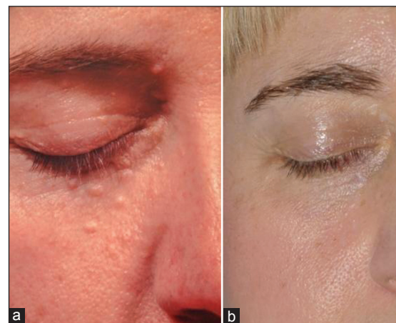
Figure 2: Sebaceous gland hyperplasia (a) treated with superpulse-mode of carbon dioxide laser (b)