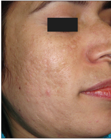
Figure 3: Post-acne scarring before treatment

patients of post-varicella and post-traumatic scarring (two each) showed a 'good' response to treatment on objective analysis.