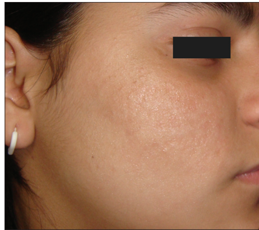
Figure 2: Post-herpetic scarring post-treatment

In patients with Grade 2 scars all nine showed an excellent response to treatment.