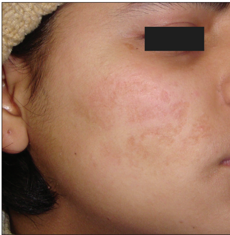
Figure 1 : Post-herpetic scarring before treatment

immediate post-treatment period was a mild crusting that persisted for one or two days. The patients were able to attend their daily duties on the same day or the next day after the dermaroller sitting.