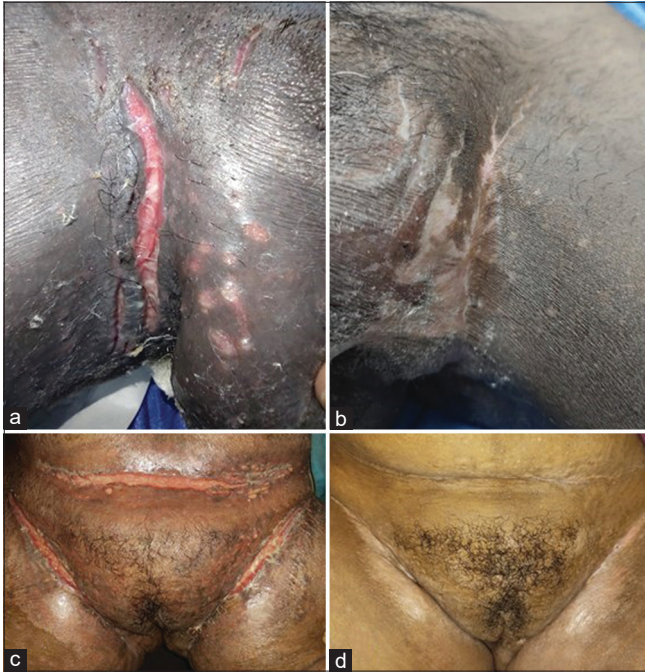
Figure 3: (a) Knife-cut ulcer in groin fold. (b) Complete healing of ulcer after weekly sessions of platelet-rich fibrin (PRF) after 4 weeks. (c) Knife-cut ulcer in suprapubic region. (d) Complete healing seen after weekly PRF after 3 weeks.

as PRP. Unlike PRP, it releases growth factors slowly and acts as scaffolding for better wound healing. 6,7 To the best of our knowledge, PRF has not been used earlier for the management of MCD. It is a safe and effective adjuvant in the treatment of this difficult disease.