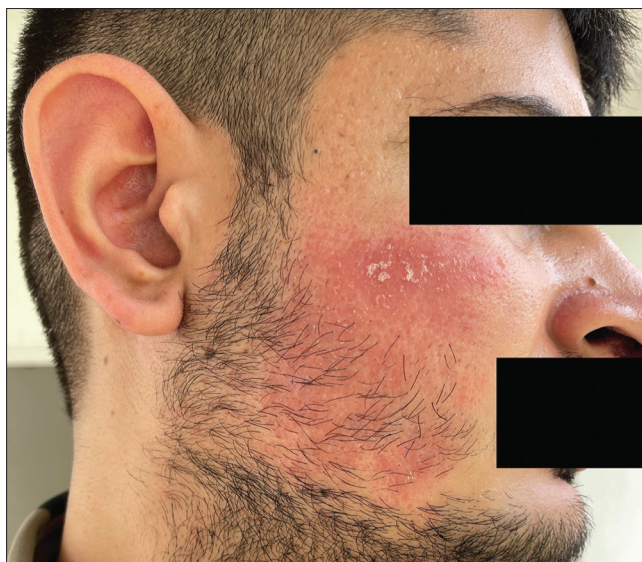
Figure 1: Persistent erythematous plaque post dermaroller over the right cheek.

A 26-year-old male presented to us with the complaint of persistent erythematous plaques over bilateral cheeks of 16 months duration [Figures 1 and 2]. The patient had undergone three