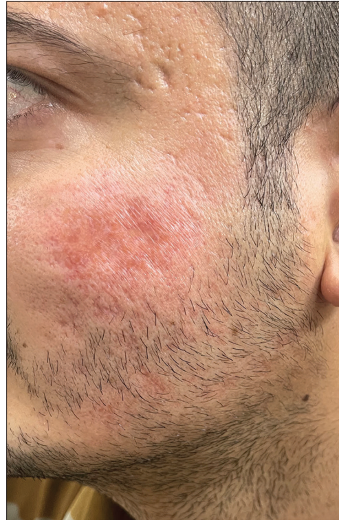
Figure 7: Marked regression in induration of erythematous plaque over the left cheek after 12 weeks of treatment.

Granulomatous reaction comprises focal aggregates of histiocytes in response to persistent inflammatory stimuli like foreign bodies or as a result of hypersensitivity. A review of