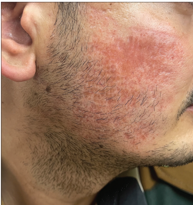
Figure 6: Marked regression in induration of erythematous plaque over the right cheek after 12 weeks of treatment.

modality employed for the management of postacne scars due to its ease of performance. Though considered a safe and effective treatment for a myriad of dermatologic conditions, microneedling has been reported rarely to cause facial granulomatous reactions. 2-4 These reactions are secondary to skin penetration of an antigenic topical product or needle material. 3