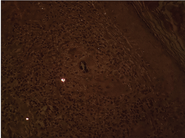
Figure 5: Polarized microscopy showed that the foreign body was not polarized.