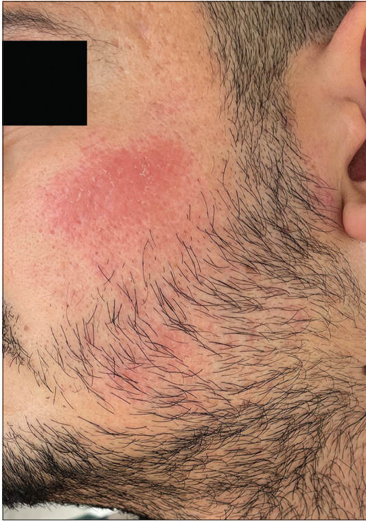
Figure 2: Persistent erythematous plaque post dermaroller over the left cheek.

sessions of dermaroller for postacne scars over a period of 4 months at 4 weeks intervals before the onset of his lesions. He gave a history of sensitivity to sunlight in the form of a burning sensation in the lesions and an increase in the erythema. The eruption had persisted for the last 16 months despite numerous treatments, including topical and oral corticosteroids, metronidazole cream, intralesional corticosteroids, sunscreens, doxycycline (for 3 months), and dapsone (for 4 months) with minimal relief.