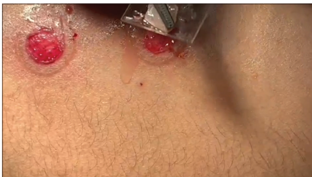
Video 1: Technique of trypsinized suction blister grafting.

We propose a modification of suction blister epidermal graft (SBEG) by trypsinization of one of the blister grafts to overcome the obstacle of pigment spread and minimize peri graft halo.