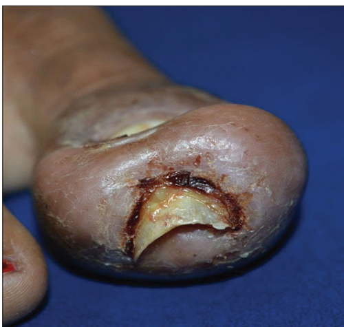
Figure 2: Frontal view of the left hallux showing granulation tissue and extended nail plate distally.