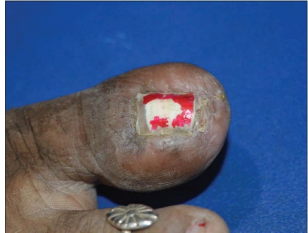
Figure 5: Post-operative photograph of the left hallux.

Surgery remains the primary treatment for harpoon nails. 1 The modified Winograd technique offers significant advantages over the traditional method, including precise curette removal of the germinal matrix and nail fold, followed by radiocautery. This approach is minimally invasive, quick, and highly effective, resulting in high patient satisfaction and low recurrence rates. In addition, it is preferred for its cosmetic benefits and minimal tissue damage. 9 Other treatment options, such as the Vandenbos procedure, Zadik's method, or the Super U technique, involve debulking all periungual soft tissues to expose the spicule. However, these alternatives tend to cause more tissue damage and require a longer healing time. 10,11