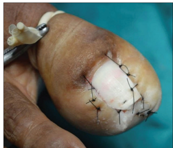
Figure 4: Immediate post-operative photograph after suturing of both lateral and distal folds.