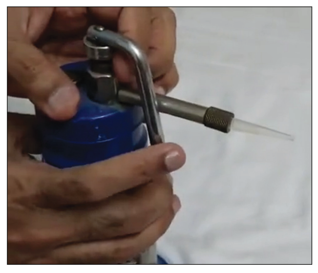
Video 1: Assembly of micropipette tip on the cryocan.

Administering cryogen in difficult-to-access areas (such as the external ear canal/concha, nasal cavity, female genital tract, and perianal area) is a challenging scenario for dermatologists and can cause significant distress to