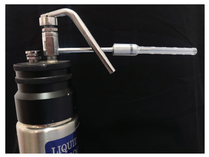
Figure 4: Customized plastic dropper as a disposable extension fitting over the standard straight tip cryocan nozzle

barrels, and disposable plastic pipettes can be cut in a similar fashion, through which the straight or bent metal tip attachments of the cryocan can be inserted to spray the cryogen [Figure 2]. We trialed these options on two different commercially available models of cryocan and found them to be safe, feasible, and highly useful. The attachment can be selected according to the size of the lesion and the depth at which it is located. The narrow tips can help the cryogen to reach the lesion without affecting normal skin. The patient who had a viral wart in the ear canal [Figure 3A] could be managed by targeted cryotherapy without affecting the peripheral