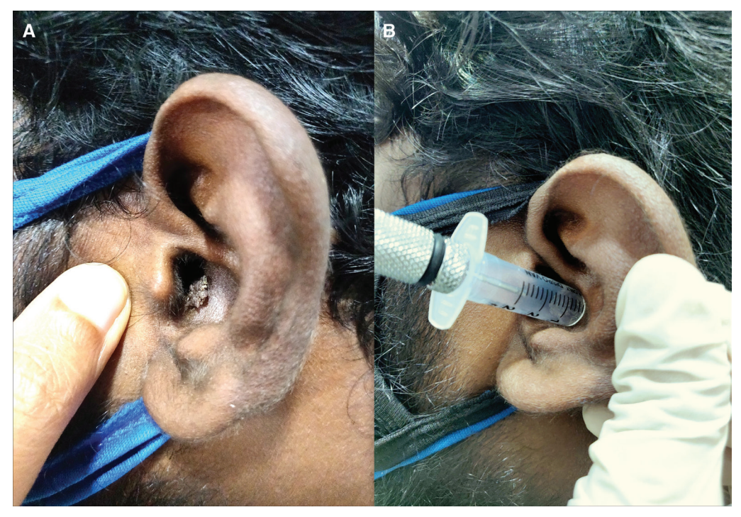
Figure 3: (A) Viral wart in the ear canal. (B) Targeted and stabilized cryotherapy using a modified syringe barrel attached over cryocan nozzle