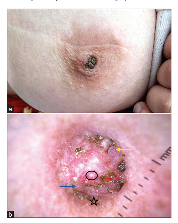
Figure 1: (a) Hyperkeratotic, papillated projections few with overlying adherent brownish to hyperpigmented crust. (b) Dermoscopic examination showing multiple papillated growths (blue arrow) having overlying curved vessels and linear vessels with branches (yellow arrow), white clods (in a circle). Yellow-brown scales and crust (red arrow) along with a peripheral brown pigmentation (black star) was also appreciated.

A 16-year-old female Fitzpatrick skin type IV presented with a history of non-itchy, painless, brownish lesion on both nipple which started around 6 years back after the patient attained puberty. Upon clinical examination, there were multiple, irregular, skin-colored projections, few with overlying adherent