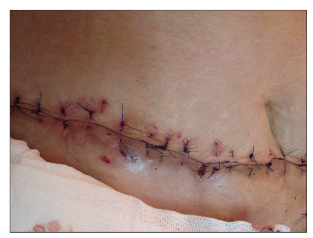
Figure 3: Pyoderma gangrenosum. After treatment: Healing lesion after surgical treatment and 1 month of prednisone therapy

wall a month before. These vesicles then ruptured and gradually developed erythematous wounds with no