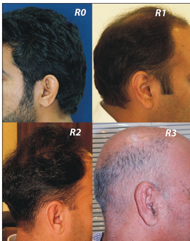
Figure 3: Reverse thinning (R)