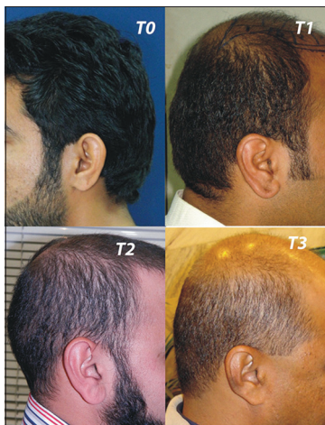
Figure 4: Overall thinning (T)

by Lee et al. in Asian population in 2007. [10] The BASP classification has various points which are difficult to memorise. In spite of the claim, it is more complicated and has limitations too. It has not been able to get a