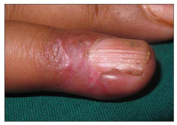
Figure 3: Post operatively (after 1 month) the wound healed with scar

Intra-operatively, a semi-translucent mass about 2 × 3 mm was seen lateral to lateral nail fold. [Figure 2a and b] which on histopathology revealed a well-defined tumour in dermis with vascular channels surrounded by solid sheet of uniform rounded tumour cells with eosinophilic cytoplasm and round to oval nuclei thus confirming the diagnosis of glomus tumour [Figure 2c-e].