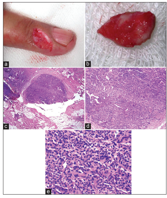
Figure 2: (a) Elliptical excision of the area of maximum tenderness on the right ring finger. (b) Ventral aspect of the excised tissue revealed semi translucent mass about 2 mm × 3 mm on lateral aspect of lateral nail fold. The excised area was did not reveal any connection to nail apparatus. (c) Histopathology of the resected tissue, H and E stain, 40×: Showed well-defined tumour in dermis with vascular channels. (d) Histopathology, H and E stain, 100×: Tumour composed of vascular channels surrounded by solid sheet of uniform rounded tumour cells with eosinophilic cytoplasm and round to oval nuclei. (e) Histopathology, H and E stain, 400×: Solid sheet of uniform rounded tumour cells with eosinophilic cytoplasm and round to oval nuclei surrounding the vascular channels suggestive of glomus tumour

Ultrasound biomicroscopy (UBM) of tender area revealed a well-defined hypoechoic mass lesion measuring 1.91 × 3.33 mm in the subcutaneous tissue and 1.95 mm from the skin surface. There was mass effect noted on the underlying nail matrix [Figure 1c]. Considering the clinical diagnosis of glomus tumour or neuroma, excision of the tender area was performed under digital nerve block and tourniquet.