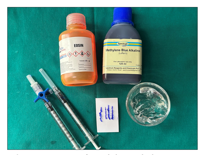
Video 1: Demonstration of stained ultrasound gel preparation as an alternative to fillers.

1 mL syringe and connected to the 3 way cannula. The dye and ultrasound gel is mixed and taken into a 1 mL syringe. When this stained mixture [Video 1] flows out of the needle or cannula during injection, it is viscous in nature and the resistance offered is comparable to the hyaluronic acid