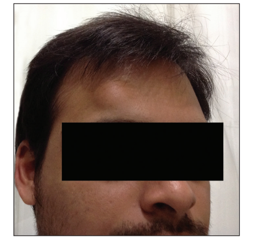
Figure 1: A 25-year-old male with a swelling on the right side of the forehead

Fletcher et al. reported that intramuscular lipomas account for about 1.8% of fatty tumours and predominantly occur