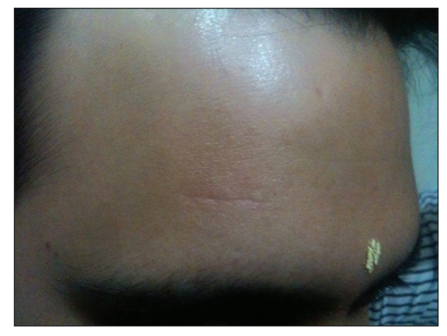
Figure 3: Post surgical scar on the forehead

in middle to late adult life.<sup>[2]</sup> Histologically, intramuscular lipoma can be either circumscribed, which shows the presence of a fibrous capsule, or infiltrative, which are associated with muscle atrophy and degenerative changes.<sup>[2]</sup> In 1943, Uriburu first reported the occurrence of lipoma in areas other than subcutis.<sup>[3]</sup> In 1989, Salasche coined the term 'frontalis-associated lipoma'.<sup>[4]</sup> Frontalisassociated lipoma may arise in one of the following locations which could be within the frontalis muscle itself, between the frontalis muscle and the deep fascia, in the loose areolar tissue between the deep fascia of the frontalis muscle and the periosteum called as 'subgaleal lipomas'<sup>[5]</sup> and beneath the periosteum.<sup>[4]</sup>