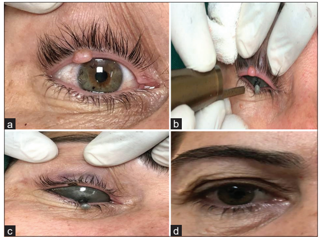
Figure 2: (a) Cystic hidradenoma on upper eyelid pre-procedure, (b) during the procedure, (c) immediately post-procedure, and (d) 4 weeks after the procedure.