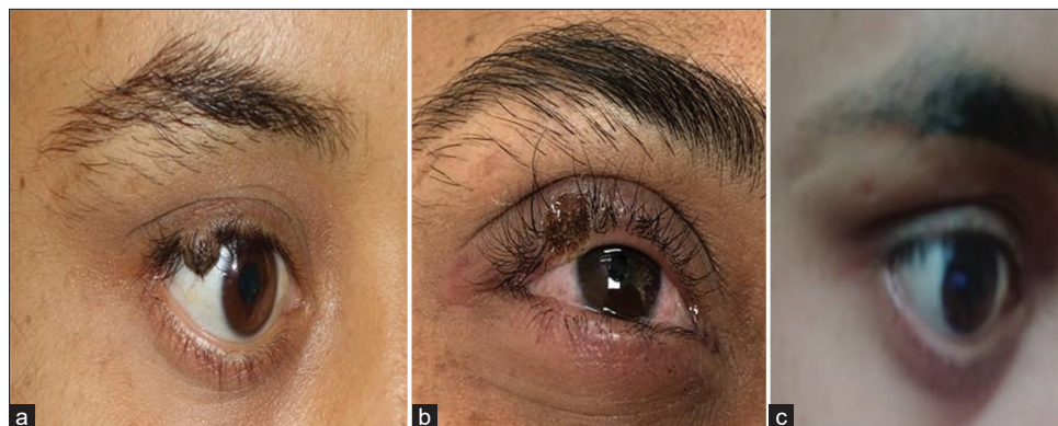
Figure 4: (a) Medium melanocytic nevi, (b) immediate post-procedure, and (c) 4 weeks later.

CO 2 : Carbon dioxide, CML: Compound melanocytic nevi