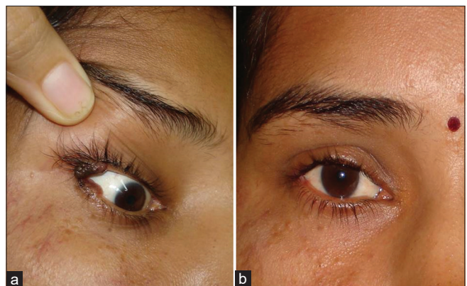
Figure 3: (a) Large melanocytic nevus of the upper and lower eyelids affecting the lateral canthus of the right eye and (b) 4 weeks after the procedure.

eyelid lesion by Al-Faky, as compared to only two patients in our case. 9 Squamous papilloma was the most common by Gundogan et al. 10 The functionality of CO 2 laser involves the destruction of the target cells directly. CO 2 laser has a greater ablation depth of 20–60 \mu\text{m} per pass and causes greater