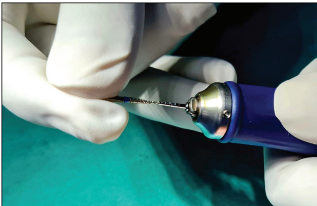
Figure 2: Technique of sharpening the punch using the dental burr by placing it through the lumen along the inner lumen of the punch